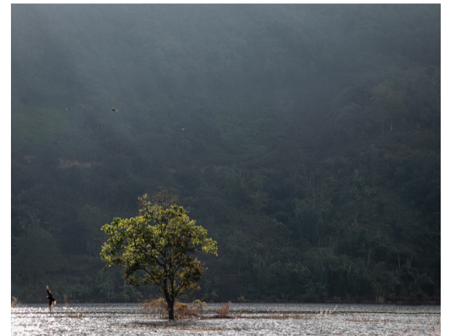
Serene Worrinphi Shimray