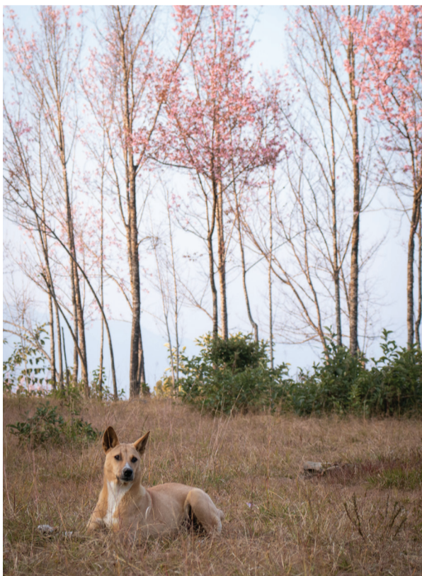
'Embracing the nature' - Worrinphi Shimray