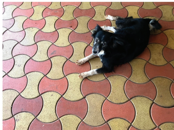
Paws and Pattern Jesly Pulikotil