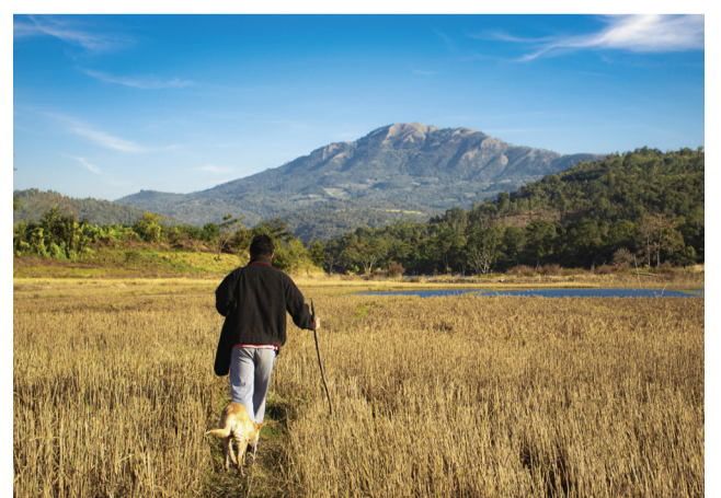
Into the wild Worrinphi Shimray