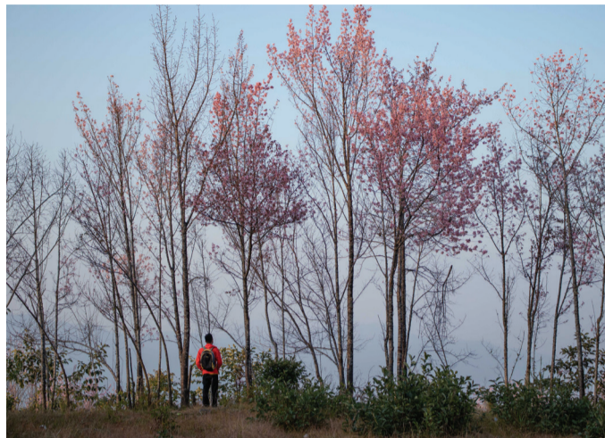
Pink side of life Worrinphi Shimray