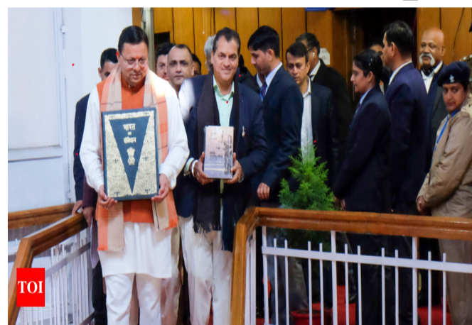
Uttarakhand CM Pushkar Singh Dhami

According to Section 378 of the UCC bill, "It shall be obligatory for partners to have a live-in relationship within the State, whether they are residents of Uttarakhand or not, to submit a state-