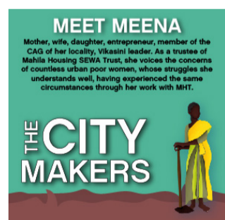
Representational Image